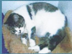
Clinic Cat Juliette