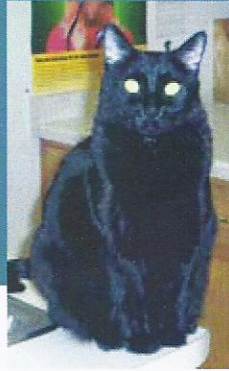
Clinic Cat Maia